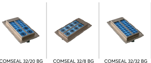
COMSEAL 32/20 BG